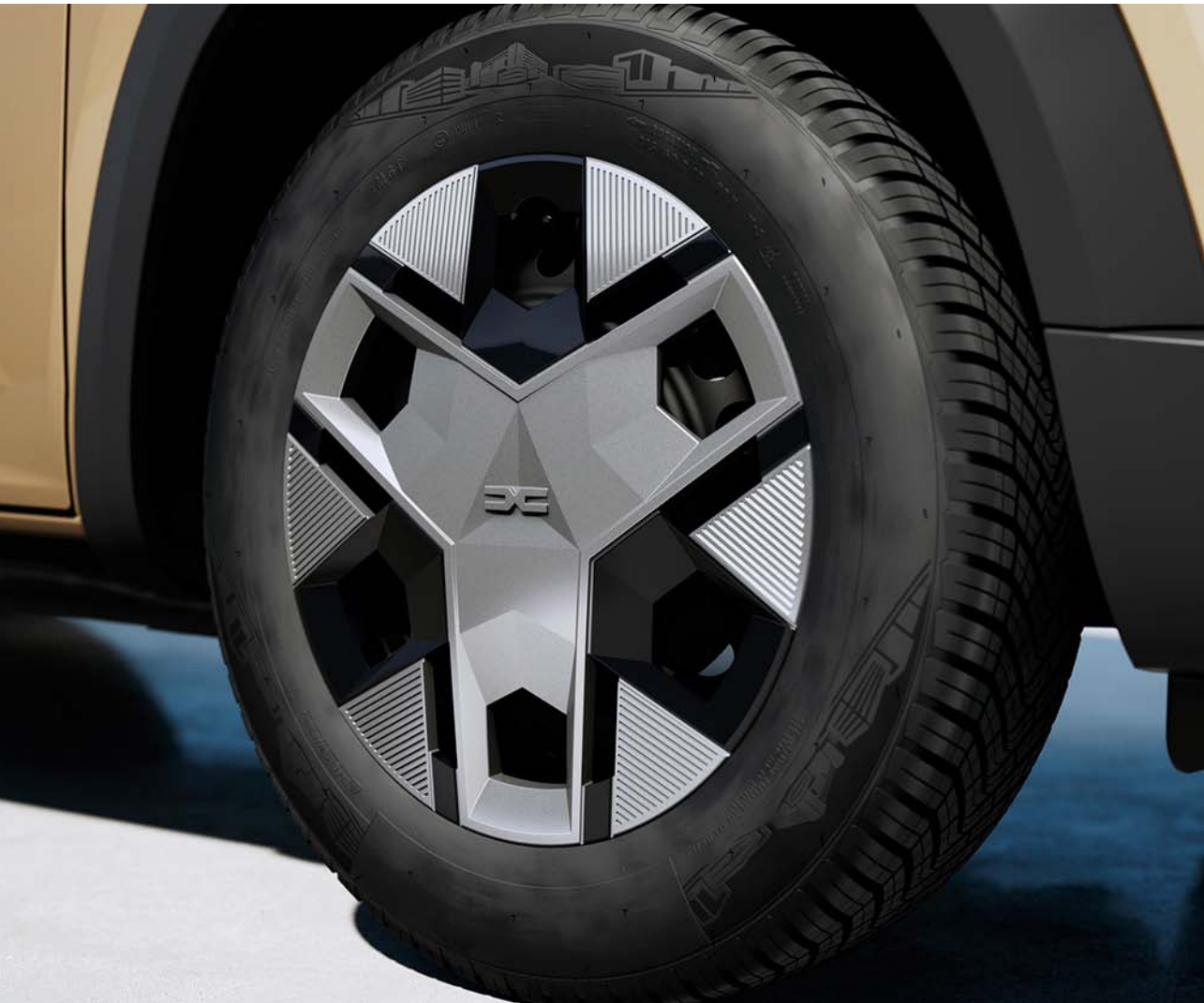
14" CIAN WHEEL CAP

Add an adventurer touch to your car with a pair of decorative roof bars: they can be installed longitudinally without drilling the bodywork.