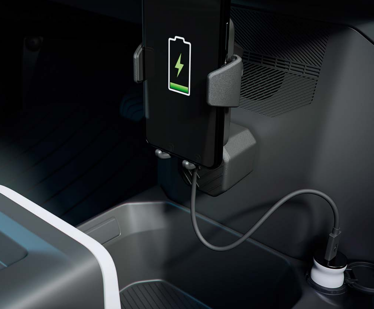
YOUCLIP WIRELESS CHARGER

Smart new accessories: YouClip. A simple and clever system for attaching a wide range of dedicated accessories to key locations in the passenger compartment in a practical and robust way. The clever 3-in-1 system combines a cup holder, bag hook and portable lamp.