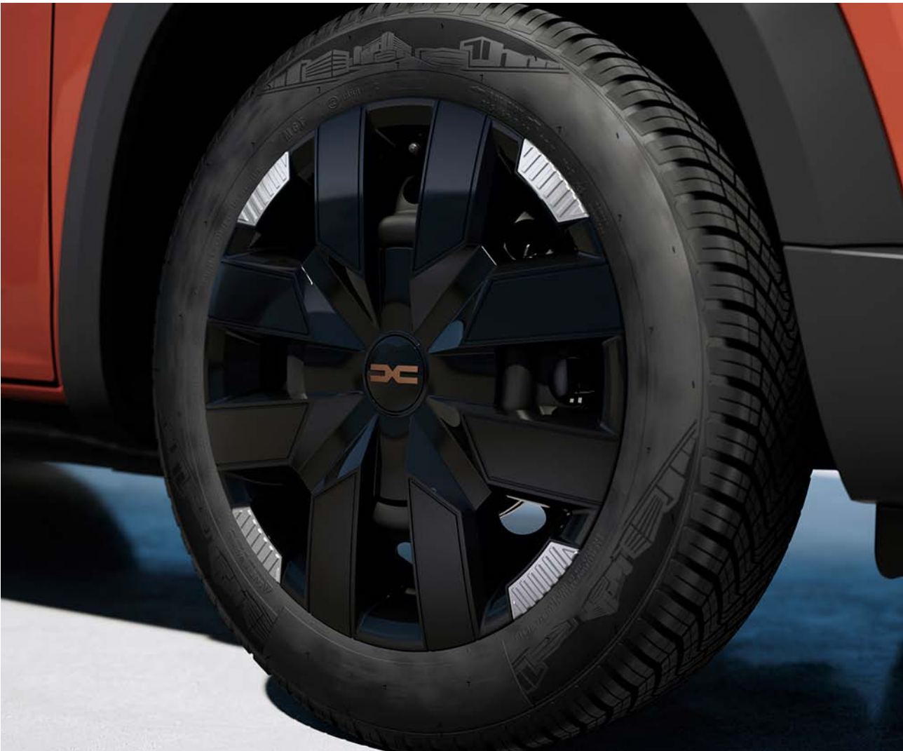
15" DANUBE WHEEL CAP